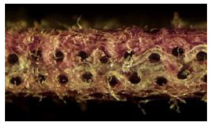
TriFlow VR ran record life of 68 days!