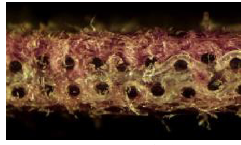
element VR ran record life of 68 days!